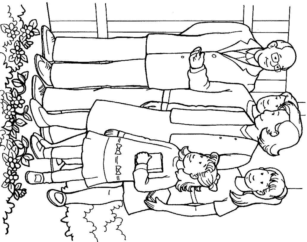
The church tells everyone Jesus' Good News.

From Thru-the-Bible Coloring Pages for Ages 4-8. © 1986, 1988 Standard Publishing. Used by permission. Reproducible Coloring Books may be purchased from Standard Publishing, www.standardpub.com , 1-800-543-1301.